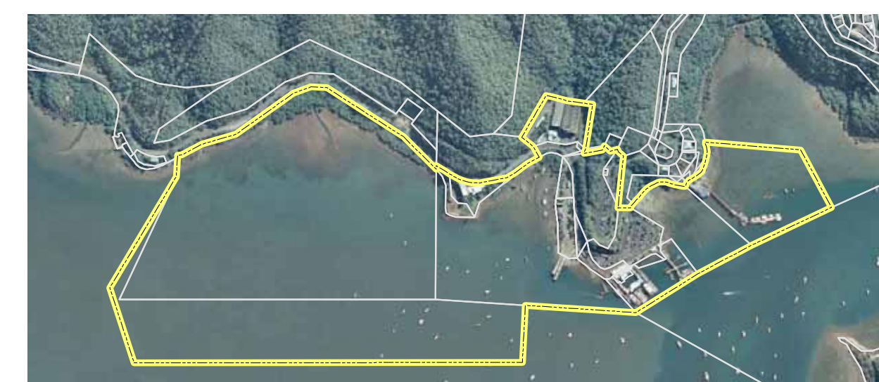
Maritime Development Areas MDA_004_007 Shute Harbour Ferry Terminal & Shute Harbour Marina (Proposed)