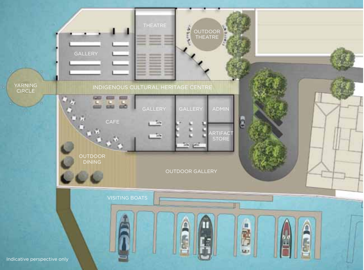
Indicative perspective only

Reef Conservation Fund Shute Harbour Marina has committed to establish a Reef Conservation Fund to support management strategies for the protection and conservation of the region, specifically the Great Barrier Reef Marine Park.