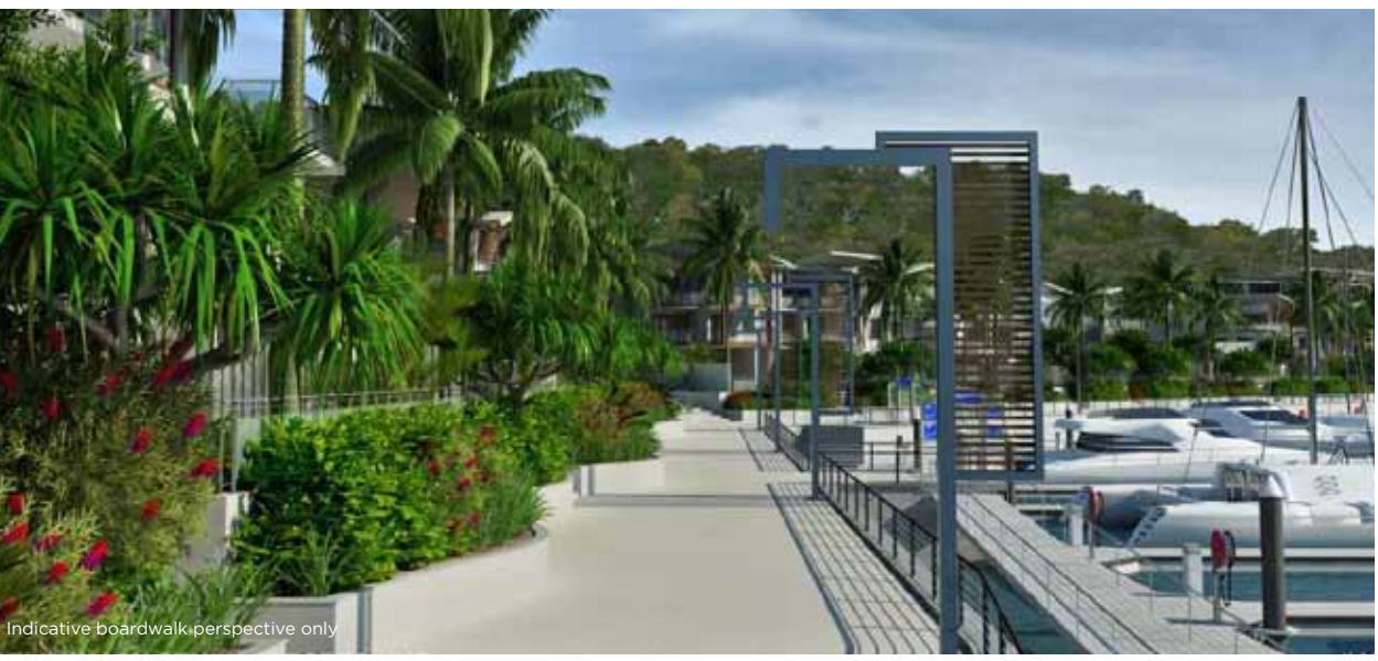
Indicative boardwalk perspective only

Public Amenity A fair proportion of the foreshore area of the development site is untidy with poor and dangerous pedestrian access. The development will provide safe boardwalk access to the new marina foreshore. In addition the proponent will unconditionally surrender back to public ownership the land north of Proserpine-Shute Harbour Road comprising approximately four hectares, on which the proponent will facilitate development of a network of pedestrian pathways, interpretative trails and lookouts connecting Shute Harbour, the proposed development and the Mount Rooper walking trails. This land can be integrated into the Conway National Park. The development of the Shute Harbour Marina Resort project will provide the opportunity for the Whitsunday Regional Council to facilitate the delivery of a new boat ramp and boat trailer park at Shute Harbour with the proponent offering to undertake $2.5 million in works as part of the construction of the marina basin.