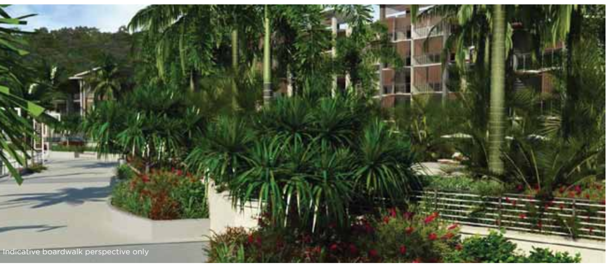
Indicative boardwalk perspective only