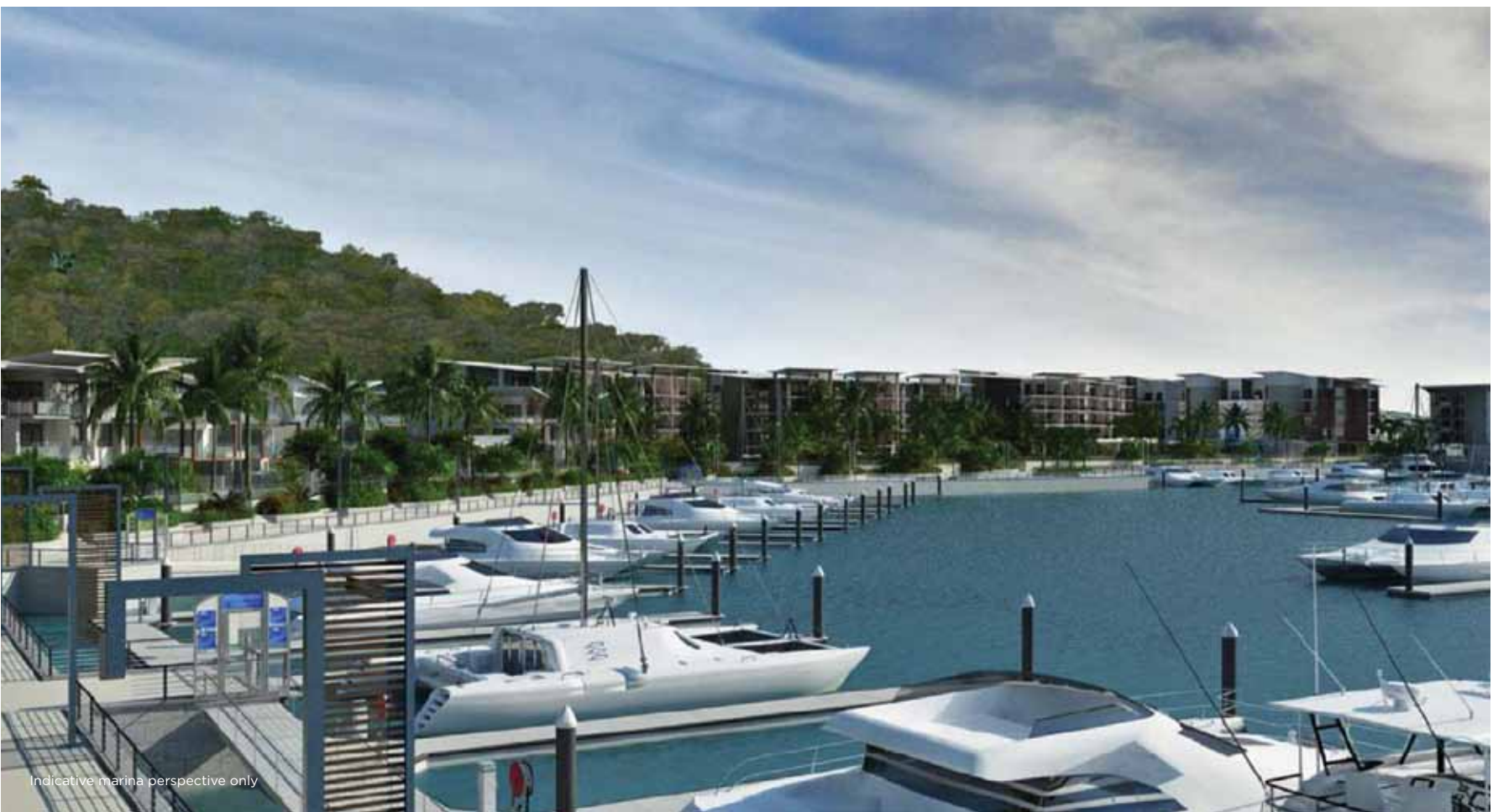
Indicative boardwalk perspective only

Illustration is concept only and subject to change